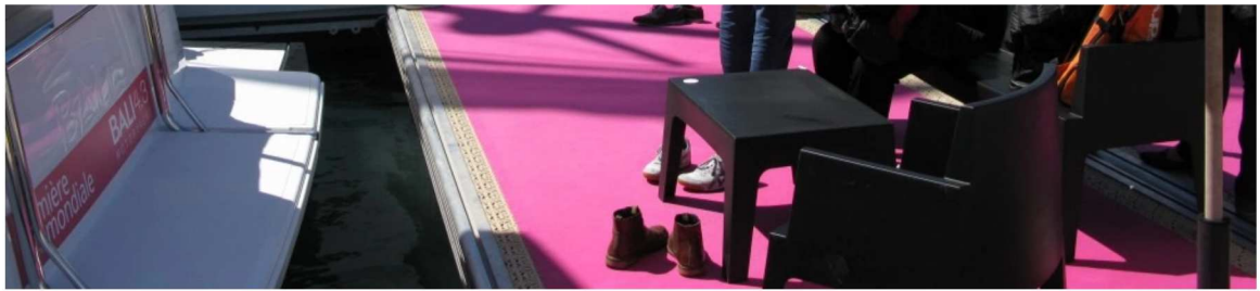
International Multihull boat show starts in 6 weeks

Here is the list of some of the novelties: