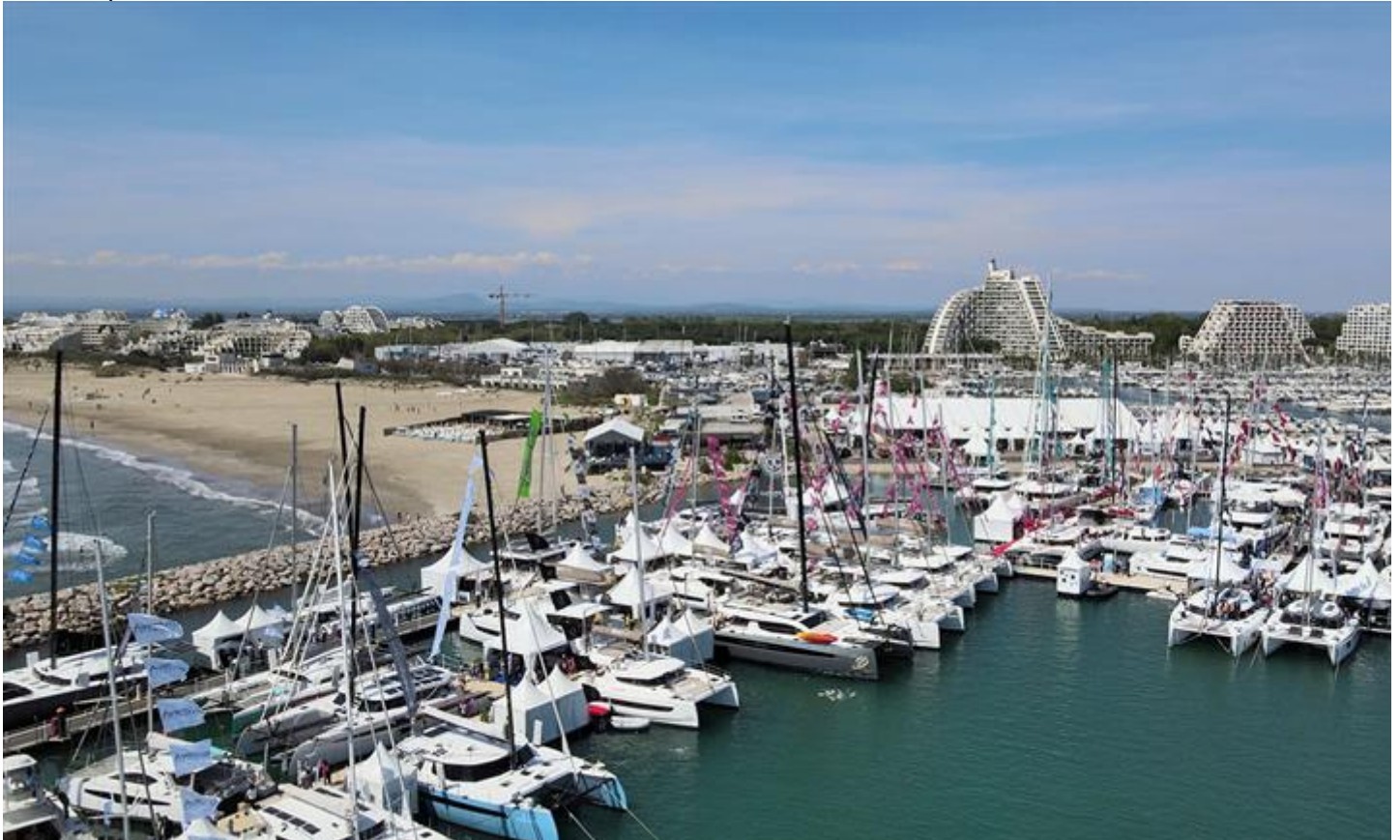
13th International Multihull Show in La Grande Motte

by The International Multihull Show 5 May 09:35 UTC 20-24 April 2022