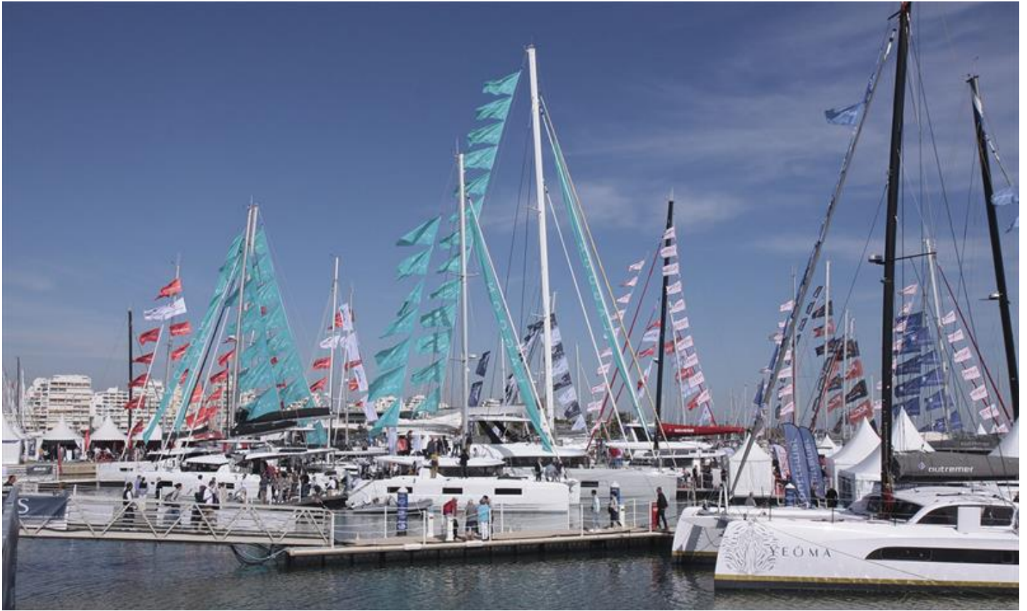
13th International Multihull Show in La Grande Motte