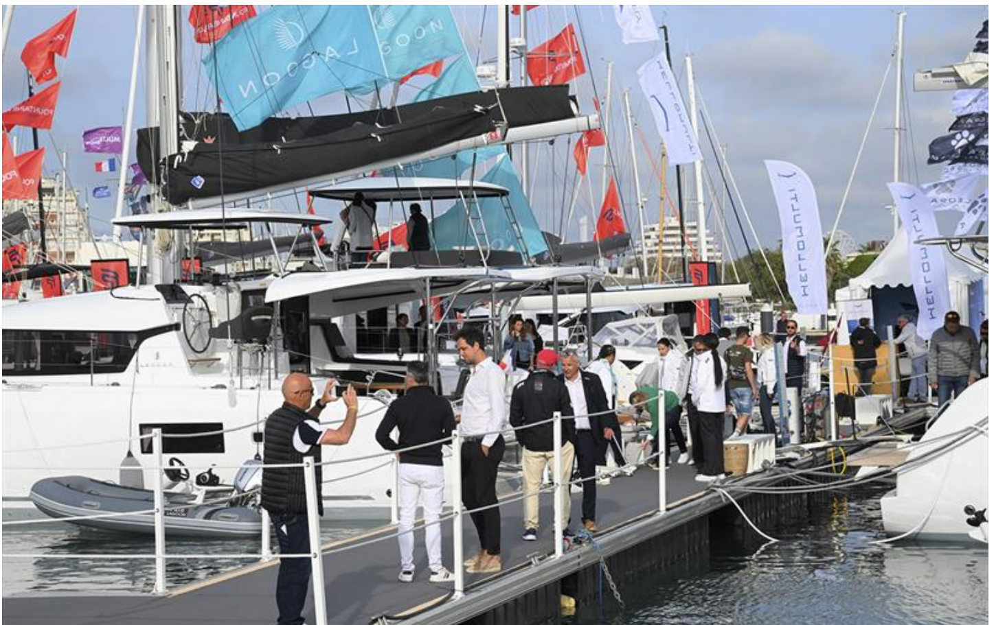
13th International Multihull Show in La Grande Motte

This latest successful edition also saw the sector do its utmost to meet the requirements of the yards. The equipment manufacturers, engine-makers, sail-makers, chandleries, banks, insurance companies and transport firms all went home on Sunday at the close of the event with a level of demand they had not seen for a long time, which is certainly no bad thing.