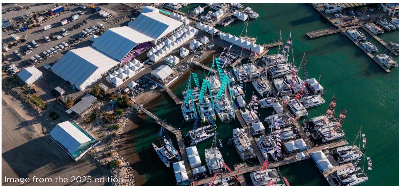
Image from the 2025 edition